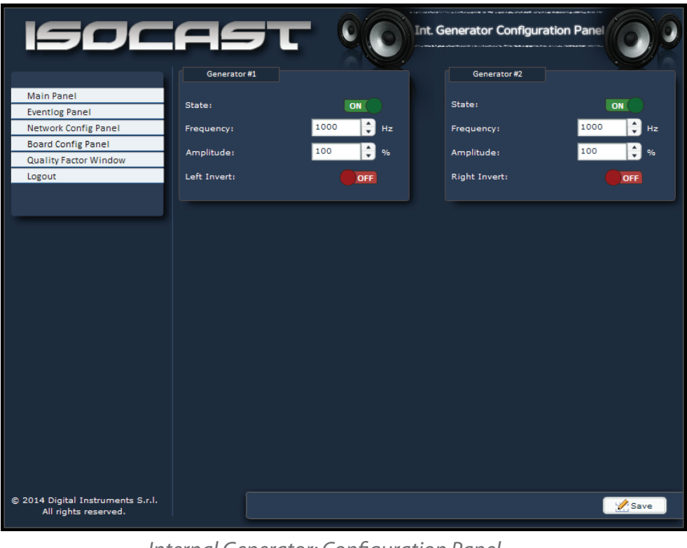
Internal Generator: Configuration Panel.